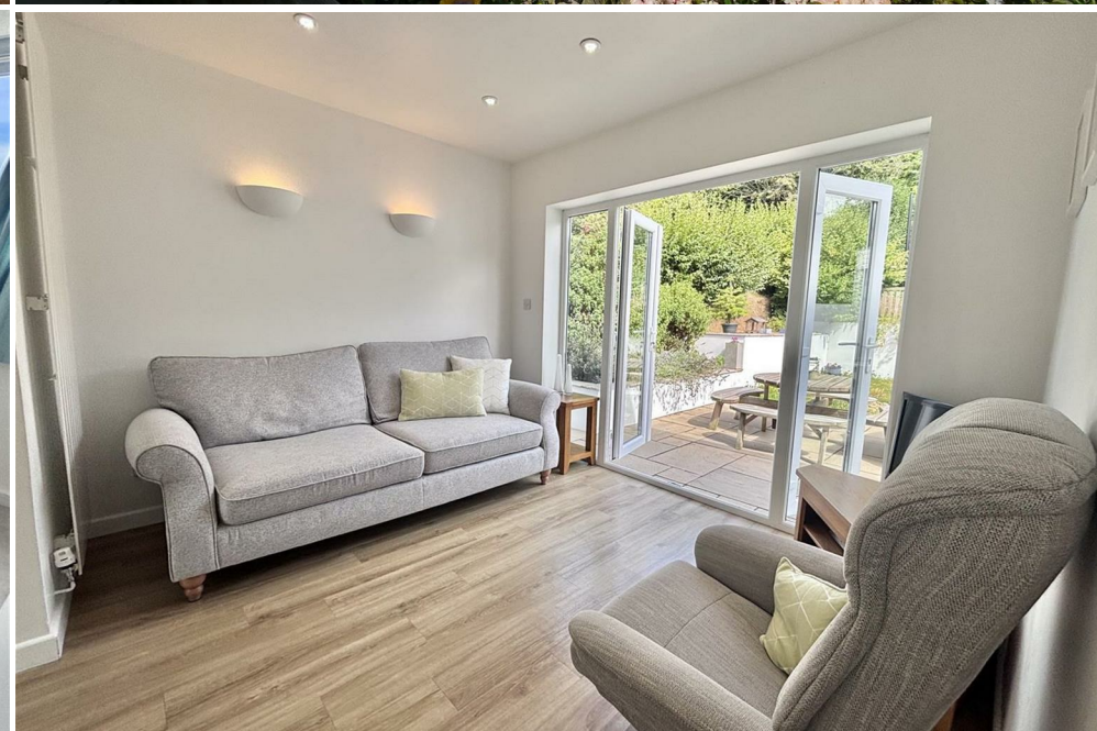
Roslyn Close, St. Austell, PL25 3UW